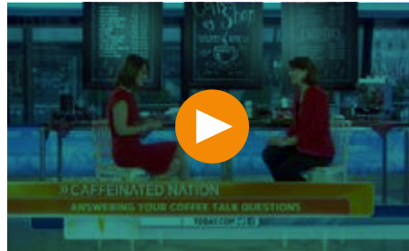
TODAY SHOW CAFFEINATED NATION